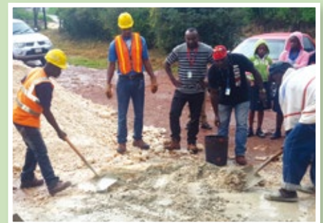
Volunteers from Jamalco paving a road at Campbell's Castle Primary School

Every employee and their family who complete more than 50 hours of volunteer work in a year can apply for a donation that will go to the institution they have been assisting. In 2016, some 130 team members lent a hand to various NGOs. In addition, 11 renovation and refreshment projects in schools and local institutes were diligently carried out by Jamalco's volunteers.