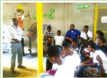
More than 40 young people are benefiting from this skills training programme

Over 40 young people in Clarendon and Manchester who had dropped out of school and were unemployed have enrolled in an 8- to 12-month vocational training programme. This will help them gain employable skills and achieve certification in electrical installation and welding, and in beauty therapy and customer service.