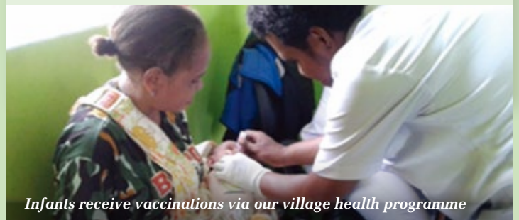
Infants receive vaccinations via our village health programme

In Ipumea village, East Barito, we have been supporting a supplementary feeding programme in collaboration with the regional community health service centre. Eggs, milk, rice, chicken porridge, green bean porridge, and bread are provided in this way. Currently 45 children and 50 elderly persons are benefiting from having extra nutrition in their diets.