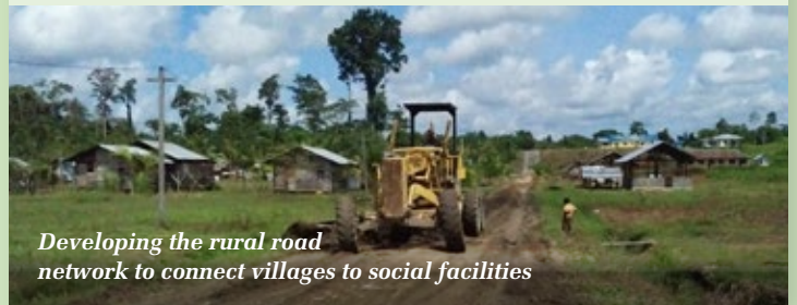
Developing the rural road network to connect villages to social facilities

The improvement in the quality of the roads means that they are now accessible to motorised transport and save users a lot of travel time.