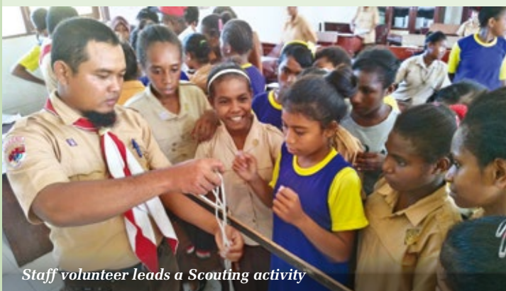
Staff volunteer leads a Scouting activity