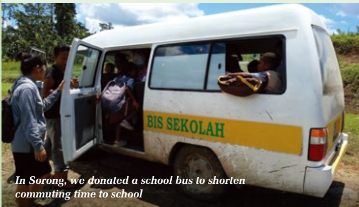
In Sorong, we donated a school bus to shorten commuting time to school

Funding has also been given for school facilities and to pay teachers' wages in South Barito. And our Noble employees have been volunteering with the Scouts at the junior high school.